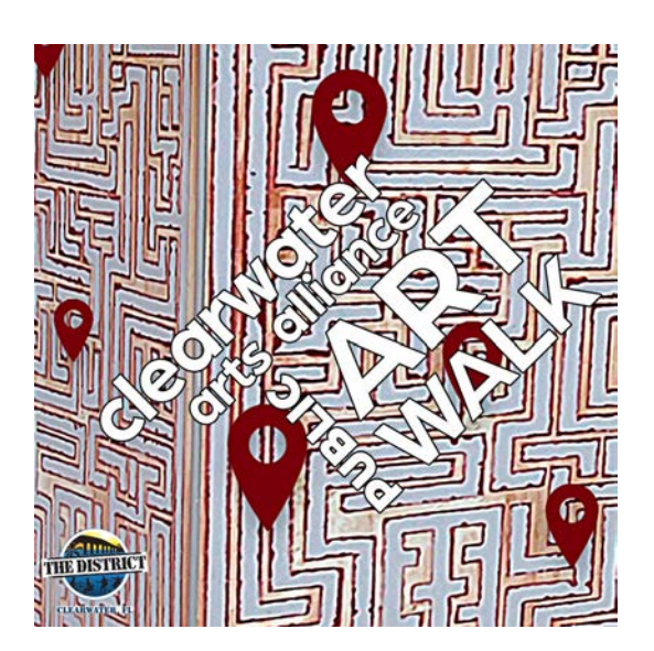
Public Art Walk

The wonderful singers of the Tampa Spiritual Ensemble present great arrangements of traditional African-American Spirituals and celebrate compositions by the best of historic and contemporary black composers.