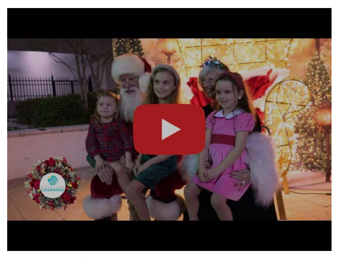
Watch Downtown Clearwater's Holiday Extravaganza 2022 highlights and memories.

The fun keeps coming in January with pirates, tournaments, bounce houses, food trucks, markets and more things to do and experience in Downtown Clearwater. Continue scrolling down to learn more and see our January events calendar.