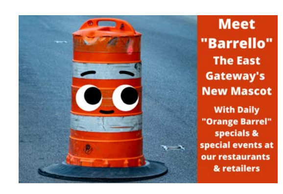
Orange Barrel Specials